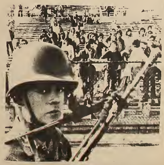
Stadium transformed into concentration camp,