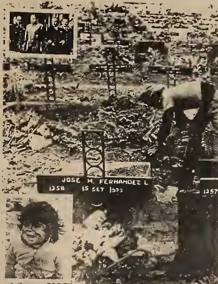
resn graves after the Coup.