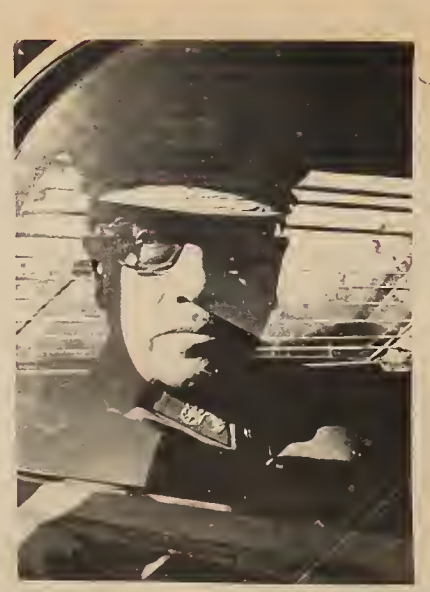
Pinochet: 'friend' of political prisoners in the USSR.

On coming to power, the Allende government initiated a programme of sorely needed social and economic reform. If a criticism of the Allende government is to be made, it would have to be that the reforms undertaken did not go far enough. The reforms far from alienating the mass of the working population, increased the government's popularity. The government saw its electoral percentage increase to 44 per cent in the legislative elections of March 1973.