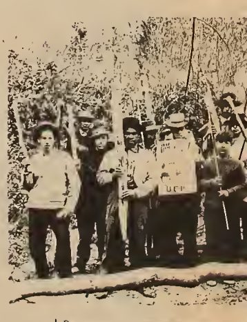
Peasants expropriate large estates in 19 below' that scared the reactionaries in such initiatives that the Coup was carrie

Workers at the morgue have been warned that they will be court-martialled and shot if they reveal what is going on there. But the women who go in to look at the bodies say there ere between 100 and 150 on the ground floor everyday. And I was able to obtain an official body-count from the daughter of a member of its staff; by the fourteenth day following the coup she said, the morgue had received and processed 2796 corpses." (quoted in The Times, 5.10.1973)