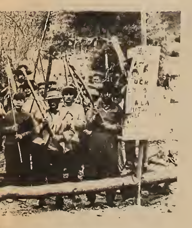
tates in 1972. It was such initiatives 'from ionaries in Chile. It was to put an end to was carried out.

Trade-union, political, and democratic rights continue to be denied. Judges still refuse to grant habeus corpus when someone disappears into the hands of the executioners of the military intelligence services. Trials are a farce, and lawyers who are too serious in defending their clients, end up in the prisoners' dock themselves.