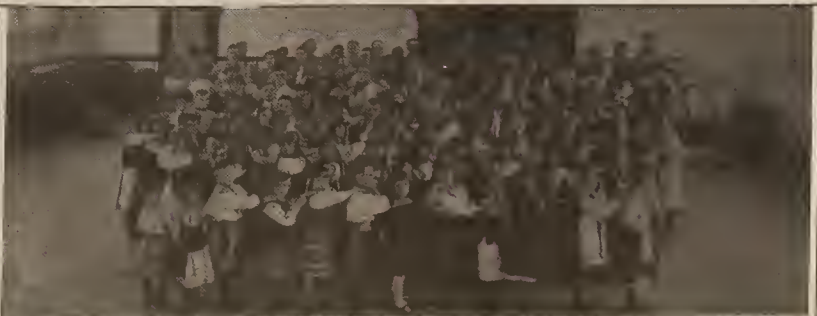
"Metelitsa" circa 1926. One of the many cultural under-takings at the Home was Ukrainian dance. These are the Ukrainian Bailet. Note the range in ages.

Each Christmas carollers ceremoniously visited the homes of the mayor of Toronto, Senator Robuck and See Lippincott, page 11