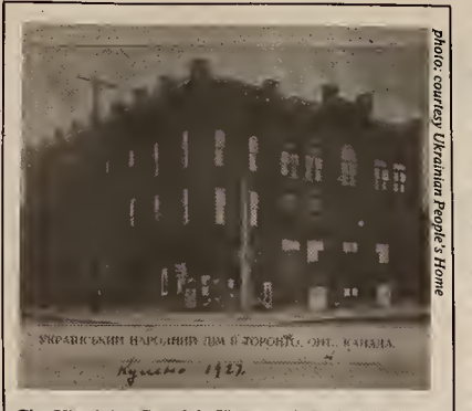
The Ukrainian People's Home as it looked in 1927. Although renovations have changed the hullding considerably since then, the variety store still remains in the corner. The Student office is on the third floor.

Despite all this activity, the Society still had no premises of its own and was having increasing dif-ficulties finding suitable facilities to rent. It was therefore decided in 1923 to raise funds specifically for the acquisition of a huilding. An empty lot (711-715 Bathurst St.) was purchased shortly thereafter and this proved to be the catalyst needed to motivate the mem-bers into becoming involved in a vigorous campaign drive to build their own home.